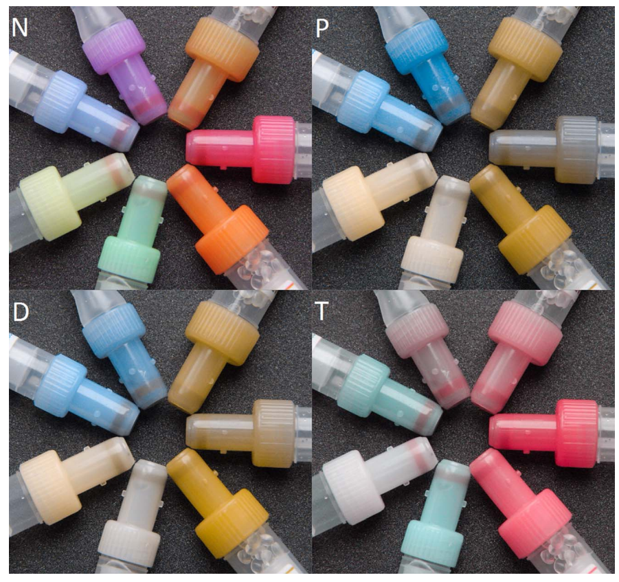
FIGURE 2. Reproductions of the normal (N), protanopic (P), deuteranopic (D), and tritanopic (T) percept of blood tubes. Dichromatic simulations were created using the Chromatic Vision Simulator, <sup>25</sup> which is based on a validated algorithm. <sup>23</sup>

medical students<sup>6</sup> not to restrict access, but to help them avoid inappropriate specialties and to be self-aware of potential sources of error.<sup>2</sup> This is particularly important because color-deficient doctors can be highly confident about tasks on which they perform poorly.<sup>2</sup>